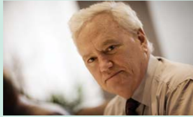
Hon RICHARD PREBBLE